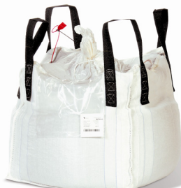
1 tonne bag