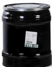
136 kg drum

For further information about our products, please visit our website ( www.vale.com ) or contact a regional sales representative.