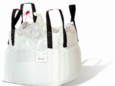
2 tonne bag

For further information about our products, please visit our website ( www.vale.com ) or contact a regional sales representative.