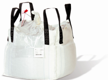
2 tonne bag

For further information about our products, please visit our website ( www.vale.com ) or contact a regional sales representative.