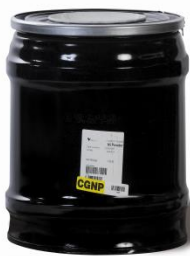
136 kg drum

For further information about our products, please visit our website ( www.vale.com ) or contact a regional sales representative.