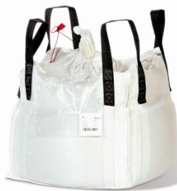
1 tonne bag