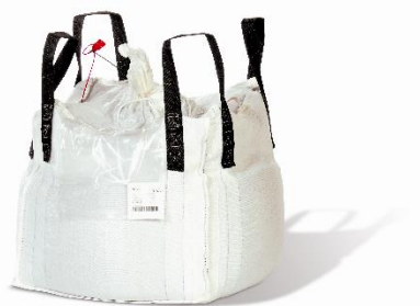
1 tonne bag

For further information about our products, please visit our website ( www.vale.com ) or contact a regional sales representative.