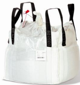
1 tonne bag