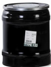
136 kg drum

For further information about our products, please visit our website ( www.vale.com ) or contact a regional sales representative.