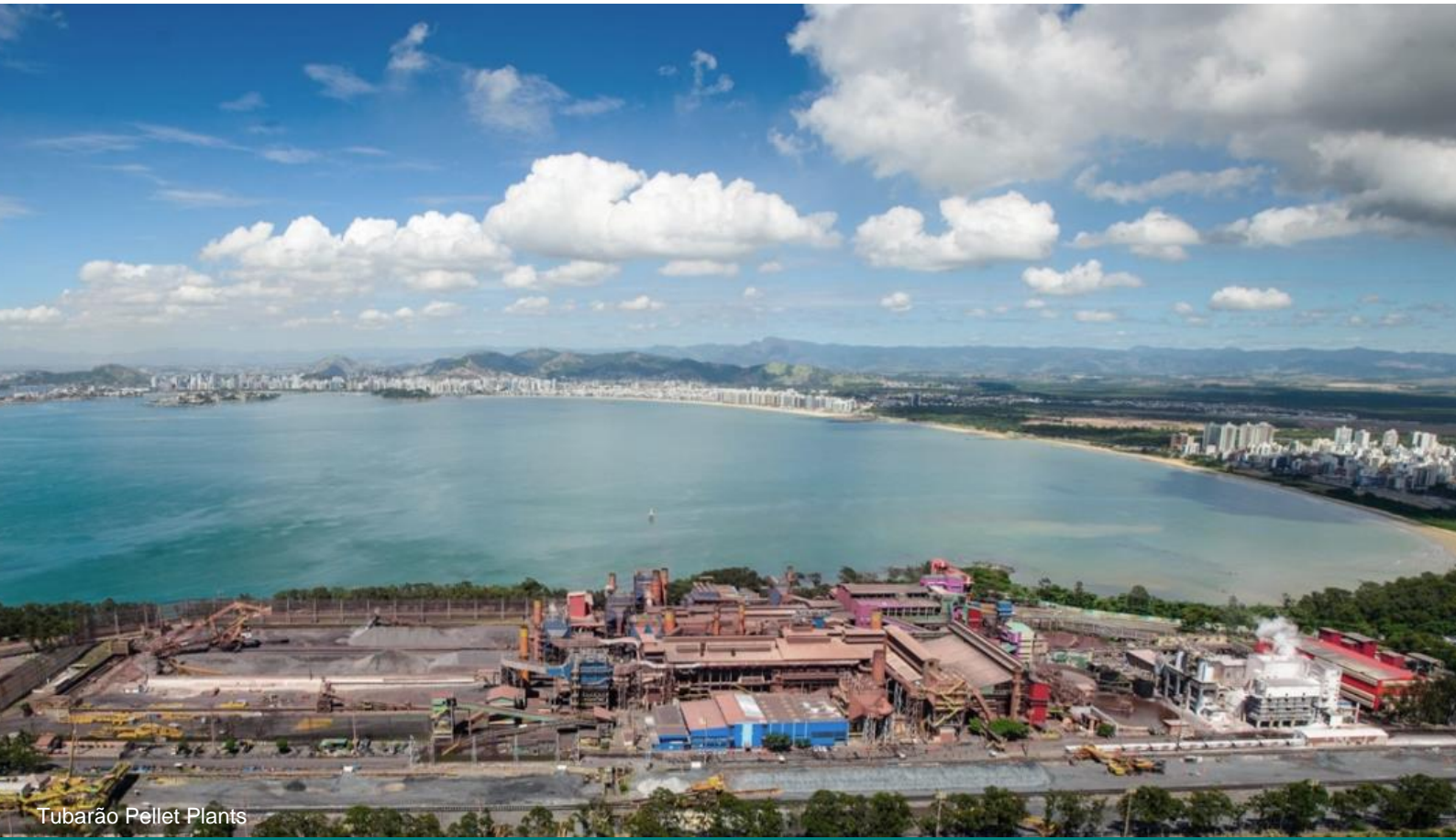
Tubarão Pellet Plants