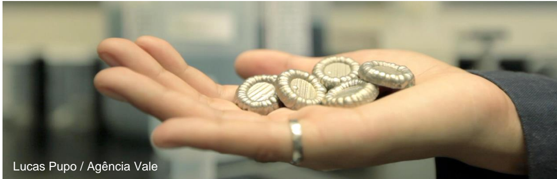
Lucas Pupo / Agência Vale