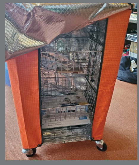
First Team 1305's UV Sterilizer box

With the funding provided, Flosonics Medical, which develops wearable sensors that improve the clinical management of critically ill patients, will be able to scale up production from 100 to 1,000 devices per week. The wearable sensors will be donated directly to hospitals across Canada.