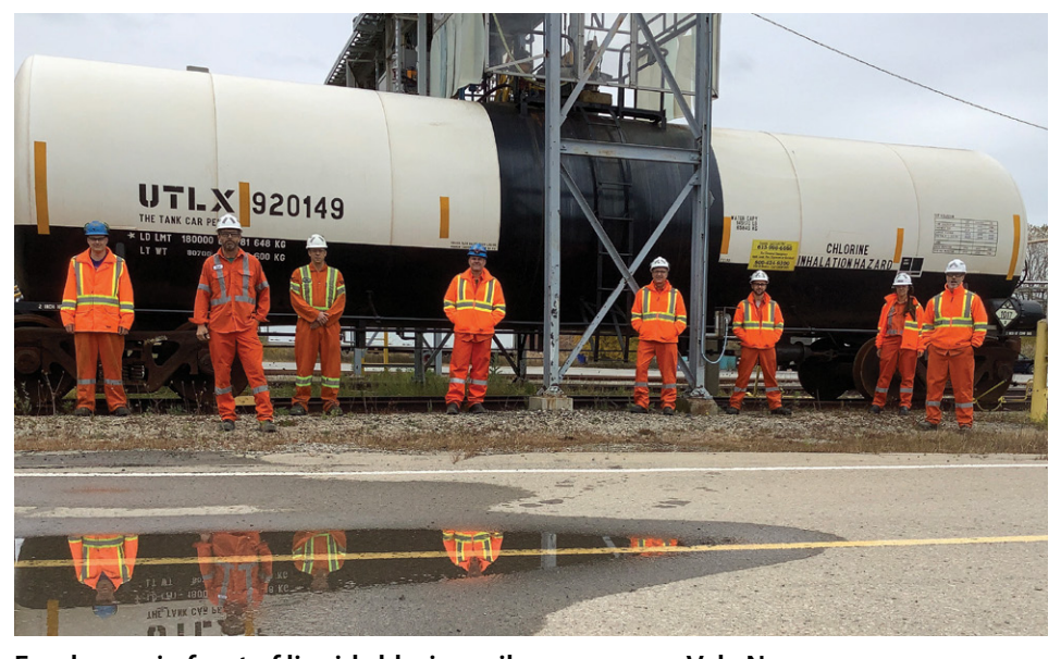
Employees in front of liquid chlorine rail car

was a safer alternative, and created a temporary storage solution for it while a permanent solution is being built and will be installed later in 2021. This change in our refining process supports our core values of Life Matters Most and Make It Happen by totally eliminating a potential risk to our employees and the surrounding community.