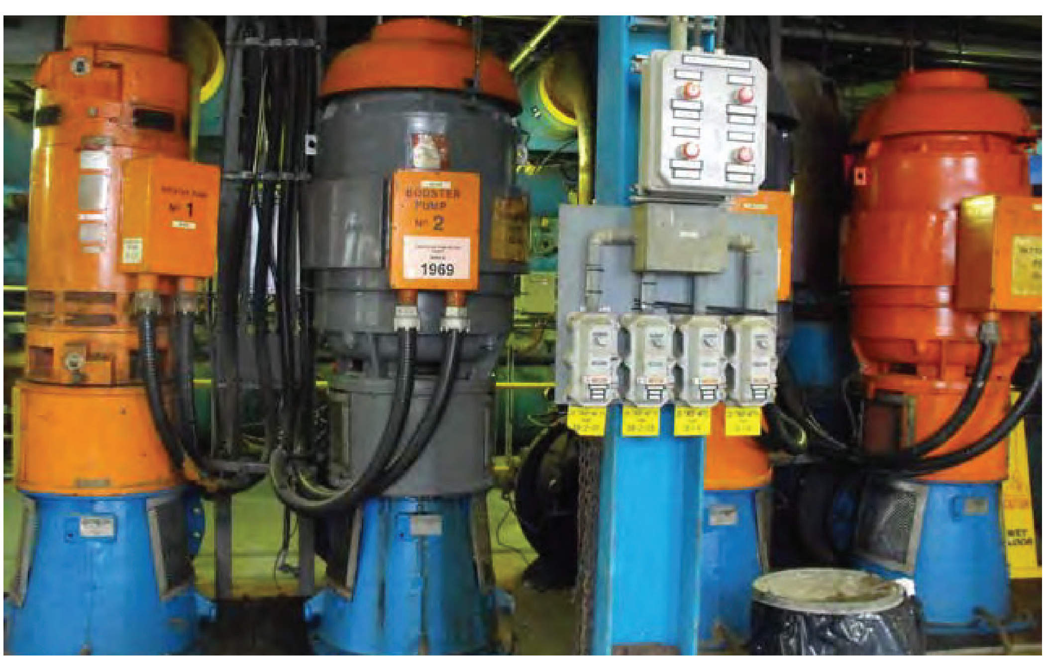
Drinking Water treatment chemicals and filtration techniques are used to clean the water to specification.